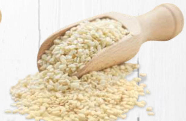
Hulled Sesame seeds